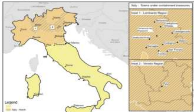
Map showing specified areas of Italy, as of 26 February 2020.

We thank you for your continued vigilance in regards to this situation, and will continue to distribute advice where appropriate. We would like to reassure you once again, however, that there is no cause for concern at the present time, and that vigilance and sensible precautions are the best policies to follow.